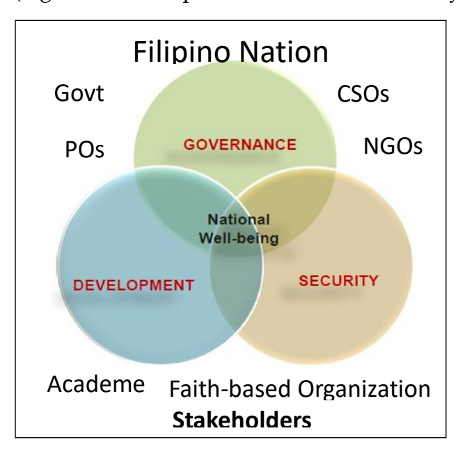
Figure 2. Development-Governance-Security<sup>4</sup> Framework

Solving the complex social problems that impact on the development and security of the country requires the collaboration of the whole nation. It calls for the government and all stakeholders to harmonize their development, governance and security efforts (Figure 2. Development-Governance-Security Framework).