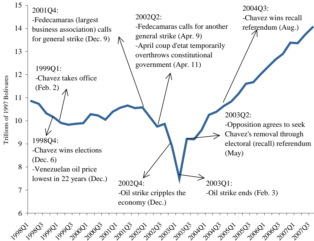
FIGURE 3 Venezuela: Real GDP (seasonally-adjusted)